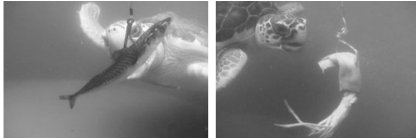
Figure 2 Observations of foraging captive turtles indicate that fish bait tends to come free of the hook while being progressively eaten by the turtle in small bites, while squid bait holds much more firmly to the hook and tends to result in more turtles consuming the hook with the squid. More research is needed.